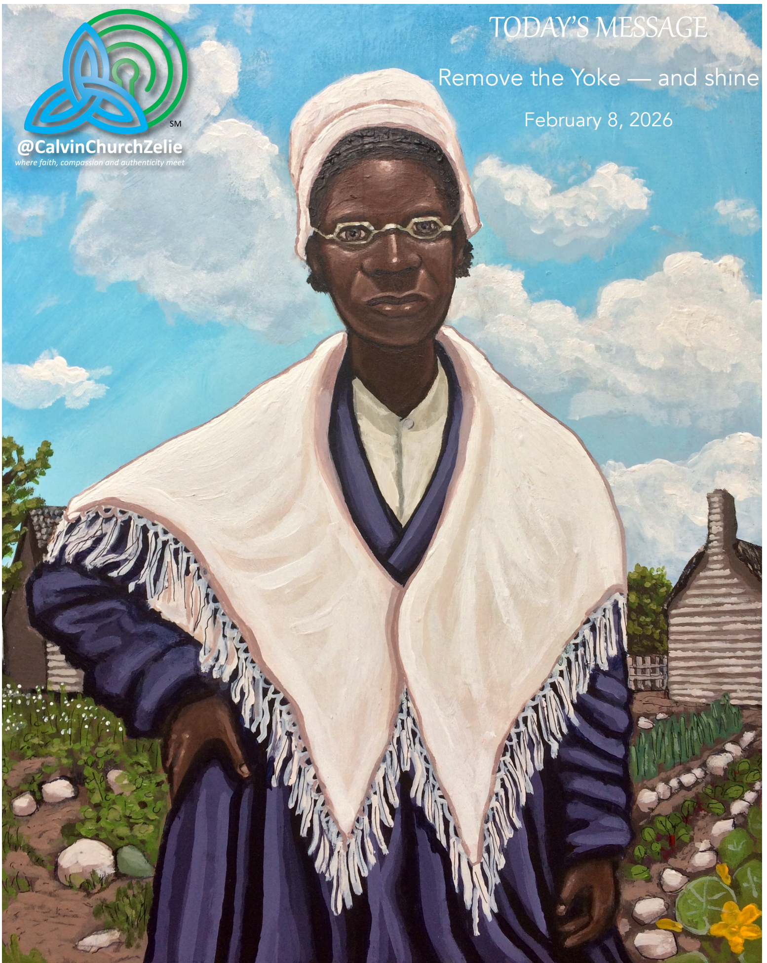
"Sojourner Truth" Kelly Latimore