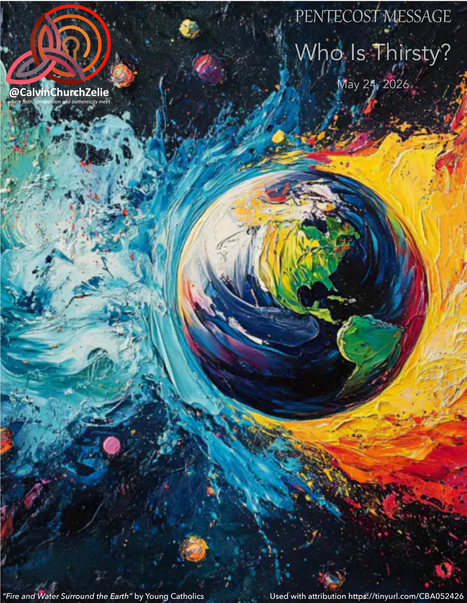
"Fire and Water Surround the Earth" by Young Catholics

Used with attribution https://tinyurl.com/CBA052426