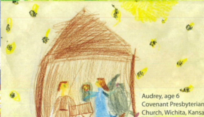
Audrey, age 6 Covenant Presbyterian Church, Wichita, Kansas