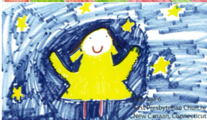
Eve, age 6 First Presbyterian Church, New Canaan, Connecticut