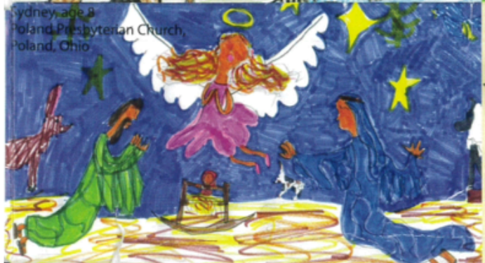
Sydney, age 8 Poland Presbyterian Church, Poland, Ohio