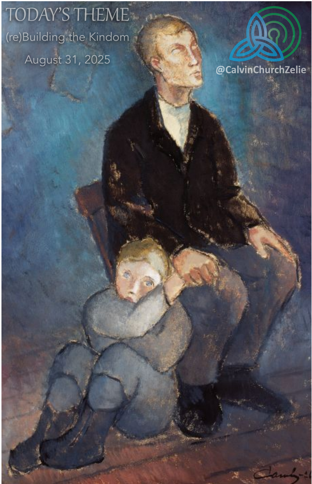
"Blind" by Alvar Cawén